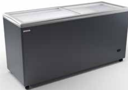
RIO H 175