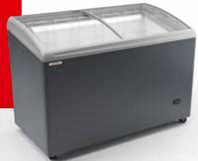
RIO S 125