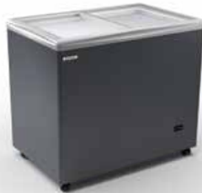
RIO H 100