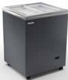
RIO H 68