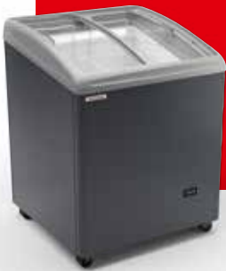
RIO S 68

RIO can be served from both sides and is the ideal solution for every area because of different size variants.