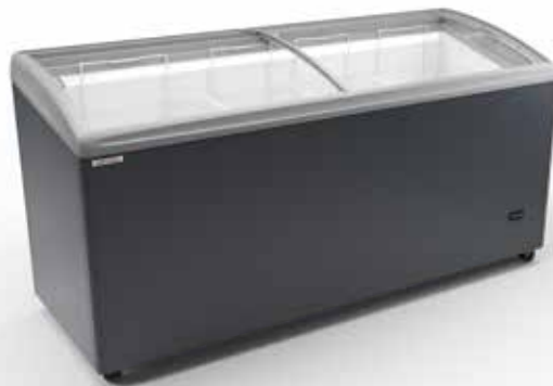
RIO S 175