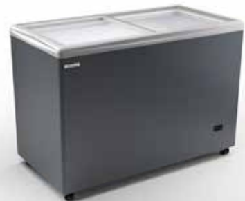
RIO H 125