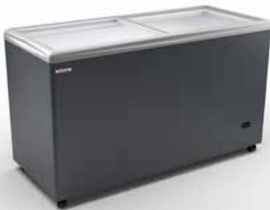
RIO H 150