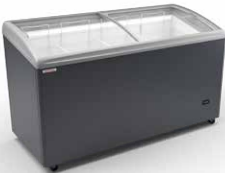
RIO S 150