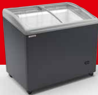
RIO S 100