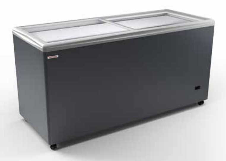
SAO PAULO H175