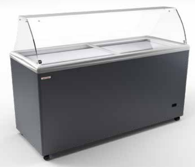
SAO PAULO H175 SCOOP