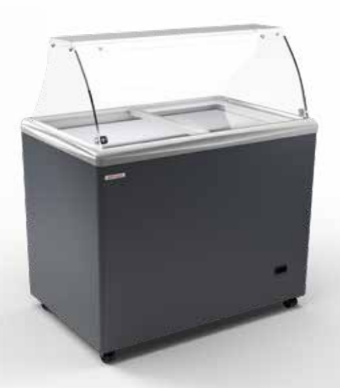
SAO PAULO H100 SCOOP