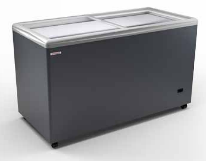
SAO PAULO H150