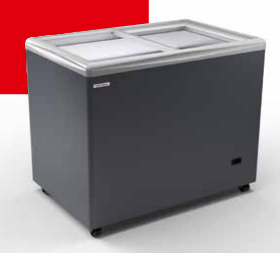
SAO PAULO H100