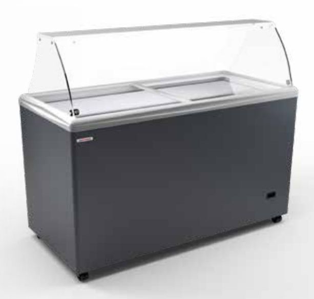
SAO PAULO H150 SCOOP