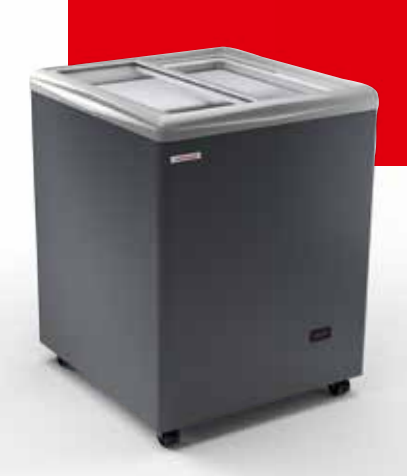
SAO PAULO H68

SAO PAULO can be accessed from all sides and provides the ideal solution due to its different variants.