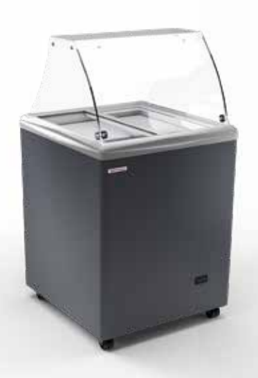
SAO PAULO H68 SCOOP