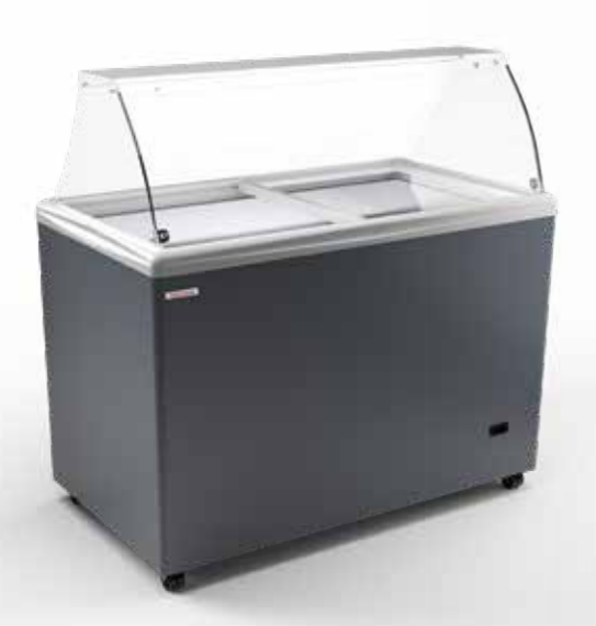
SAO PAULO H125 SCOOP