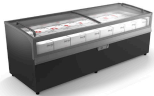
Chest freezers and chillers

MONTREAL ATHEN MIAMI PARIS SYDNEY MACAO LISBOA