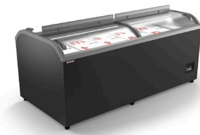
Ice cream freezers