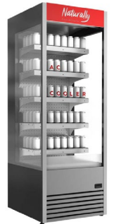
F&B - Be cooler