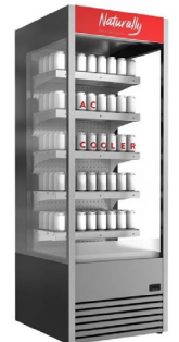
F&B - Be cooler